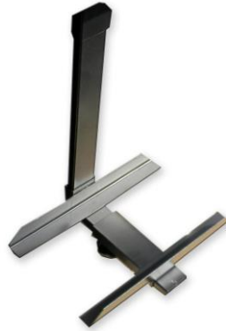
Optional PC holder (ref: PC1)