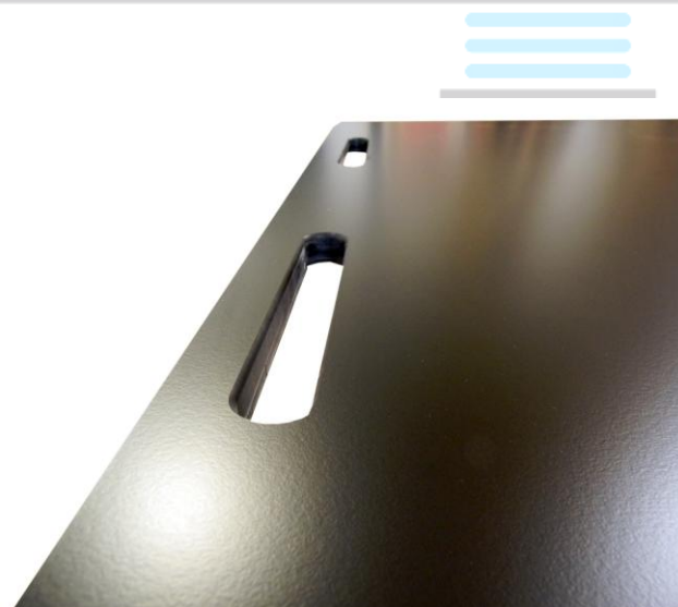
Standard slit for pipe and tubing