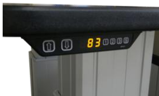
Optional position display with 3 memories (ref : BCHPOS)