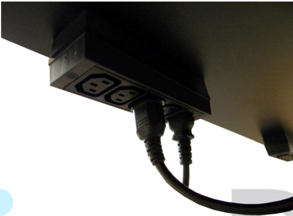
Optional IEC power strip (ref: IECKIT)