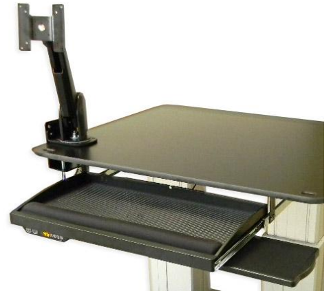
Optional monitor arm + keyb. shelf (ref: ARM1)