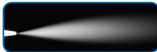
Produces a fine aerosol for high transport efficiency