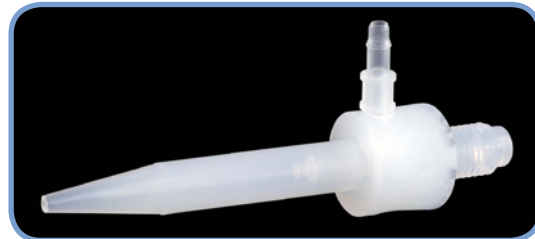
PFA-ST Nebulizer (ES- 2040)