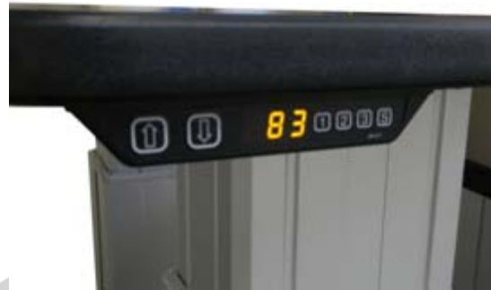
Optional position display with 3 memories (ref : BCHPOS)