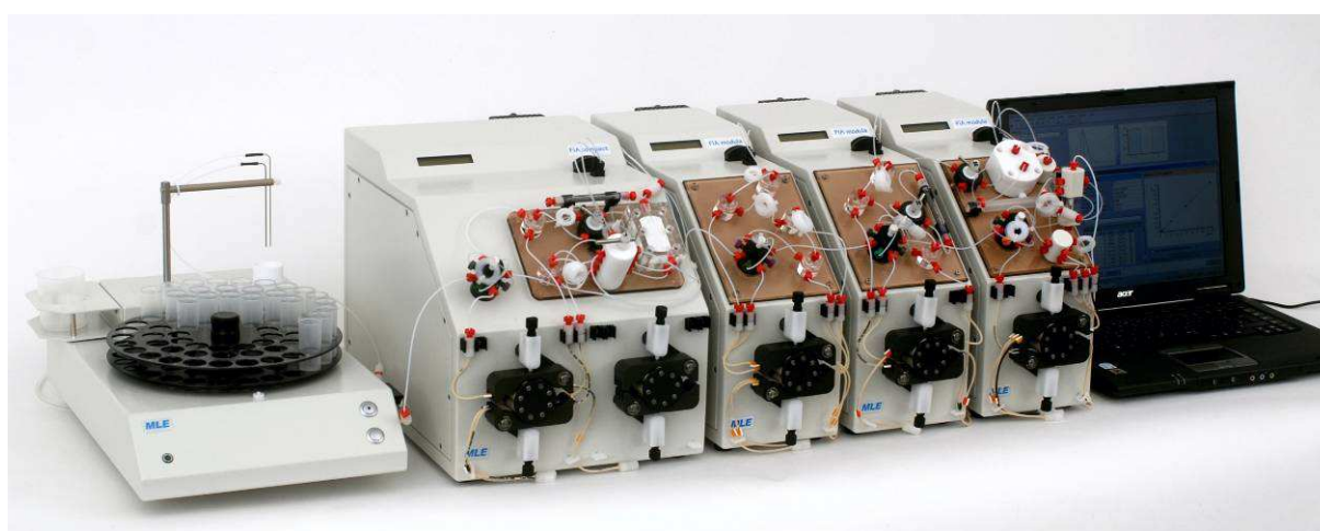
Combination of FIAcompact und FIAmodula