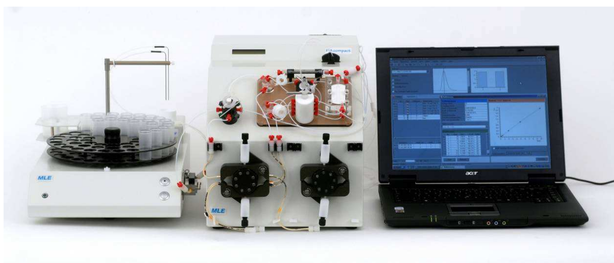
FIAcompact with Universal-Method-Unit (o-PO 4 , NO 2 , NO 3 , NH 4 )