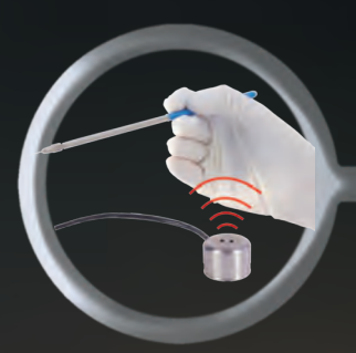
External DoubleClick IR-Sensor touch-free flame activation, made of

with integrated pressure regulator for gas cartridges CV 360 for gas cartridges Express 444