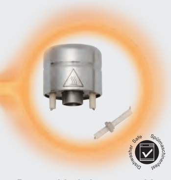
Removable & decomposable burner head, autoclavable, completely made of stainless steel and ceramics

Gasprofi 1 SCS micro - Series: Safety and comfort in the smallest possible space. Optimal for all flame-related applications in the laboratory.