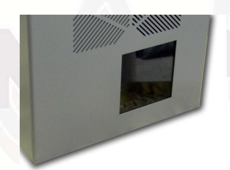
Window for easy oil level check